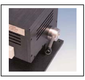
Comes standard with easy pull handle & indicator power light. (can be fitted for left/right handed use).