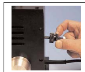
Screw-in stop allows you to regulate adhesive dot sizes