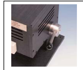
Comes standard with easy pull handle & indicator power light. (can be fitted for left/right handed use).