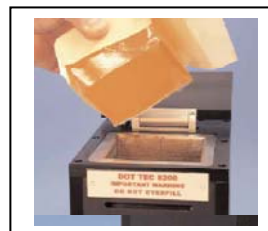
Easy load tank, taking ½ kilo PEEL-TEC adhesive blocks.